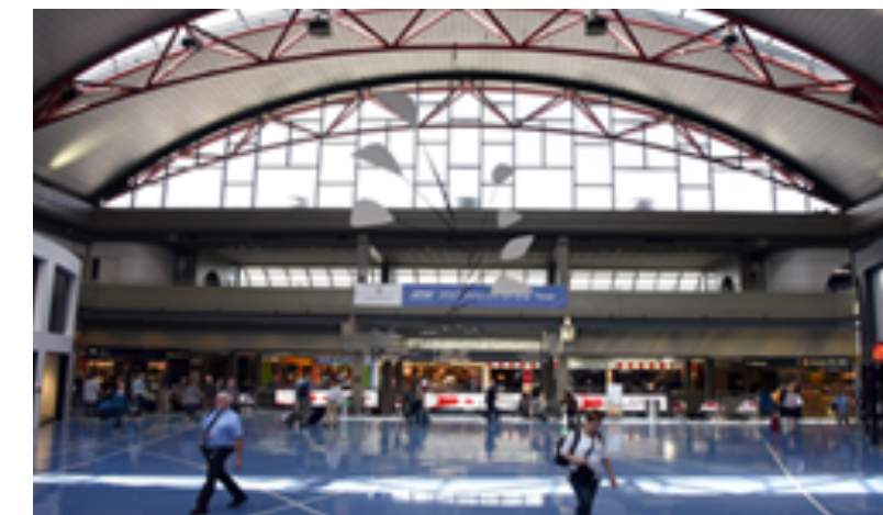
Pittsburgh International Airport, Pennsylvania, USA