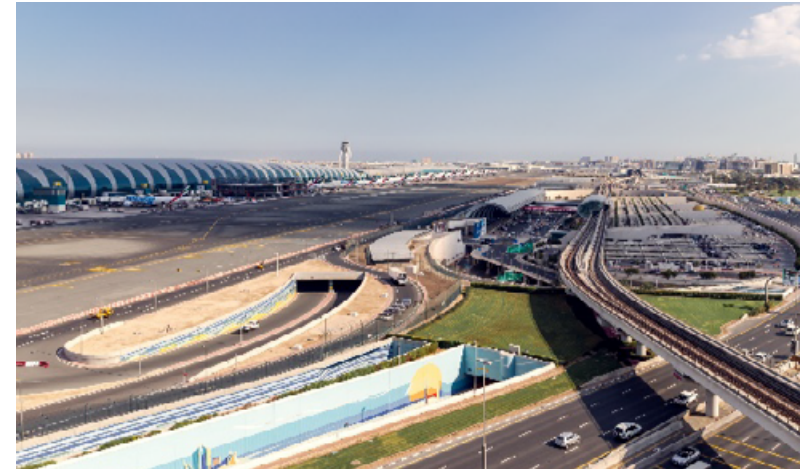
Dubai International Airport, United Arab Emirates

Honeywell empowers airports worldwide to reach optimized operational potential.