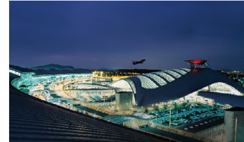
Incheon International Airport, South Korea