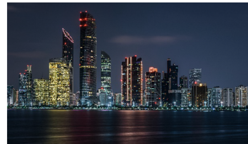
Abu Dhabi Airports Company, United Arab Emirates