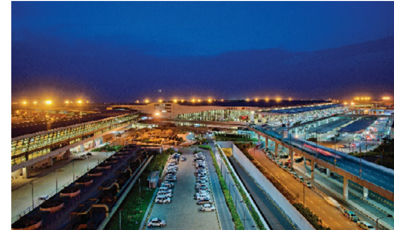
Indira Gandhi Airport, Delhi, India