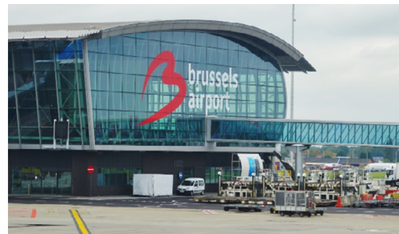
Brussels International Airport, Belgium